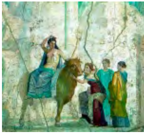
The Abduction of Europa (on a wall fresco in Pompeii)